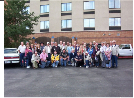
2006 Reunion Group Picture after the Aircraft and Museum tours....

Again this year we had a silent auction, with many beautiful pieces of