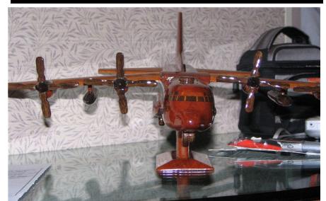
One of the many items offered at the Silent Auction.