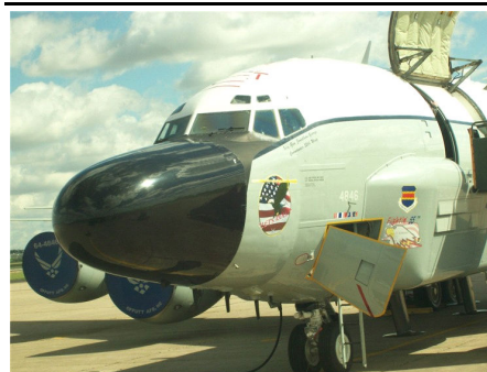
RC-135W Visited on the aircraft Tour