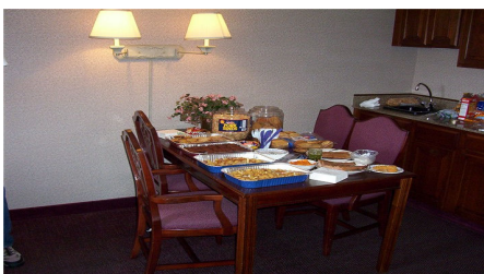
Snacks in the Hospitality Room

(Continued from page 5) ground the aircraft.