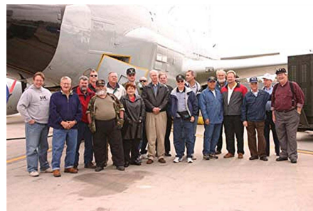
Outstanding photo of Everyone at 842!!