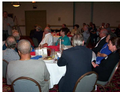
The AMTA Banquet was more than a success, it was fantastic. A great time for all