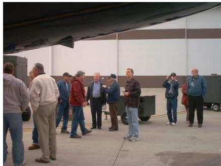
AMTs with RC 135 at Offutt