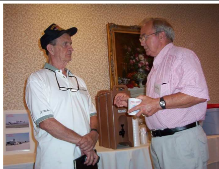
Del lying to Pat, but is Pat taking it in?