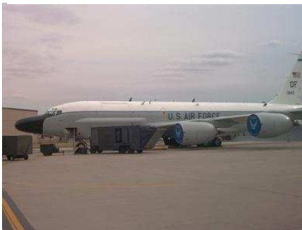
One of the RC 135s today, Offutt