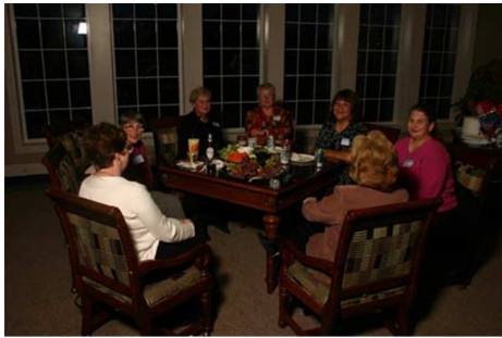
Nice to see the ladies enjoying themselves. Fellowship time in Omaha, NE.