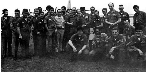
A photograph from a long, long time ago.