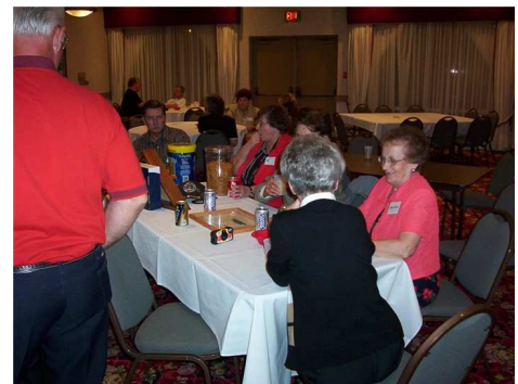
Fellowship with friends in San Antonio...