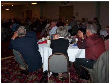
During the AMTA Banquet, San Antonio, TX