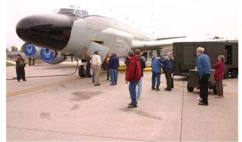
Does this make you think of the good ole days?