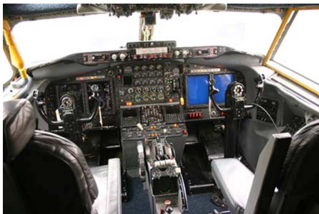
A really great cockpit shot, Offutt, Omaha

No, we do not provide the answers. Sorry!