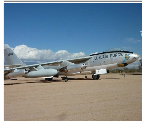
Boneyard B-47 - Now they are fond memories. Then, well.....