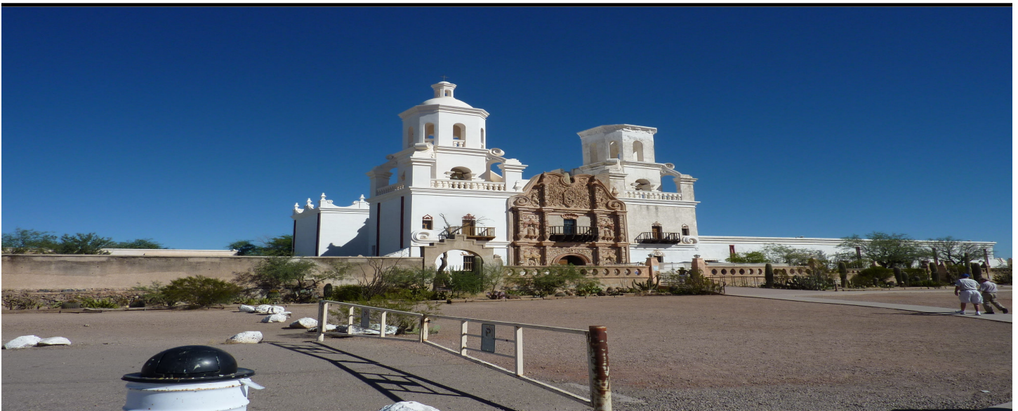
See what you missed! Mission San Xavier. Tucson, Arizona