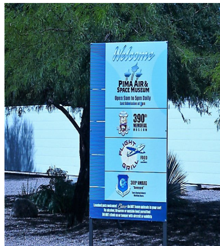
Pima Air and Space Museum