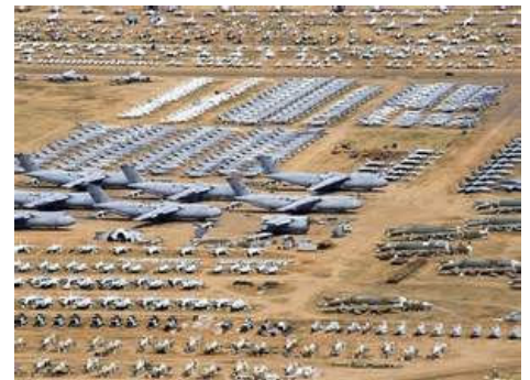
The "Boneyard" at Davis Monthan AFB, Arizona