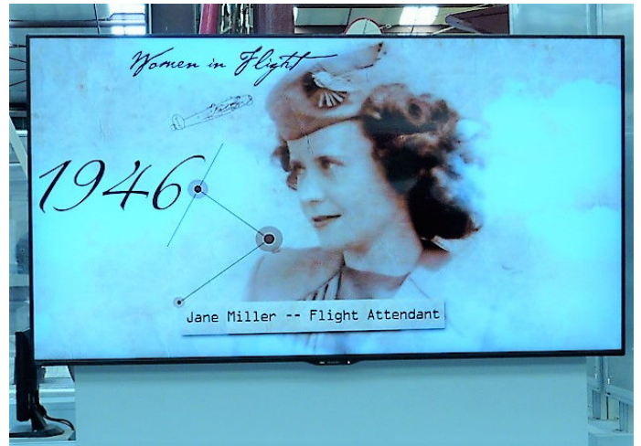
Least We Not Forget Our Women In Flight - Pima Air and Space Museum