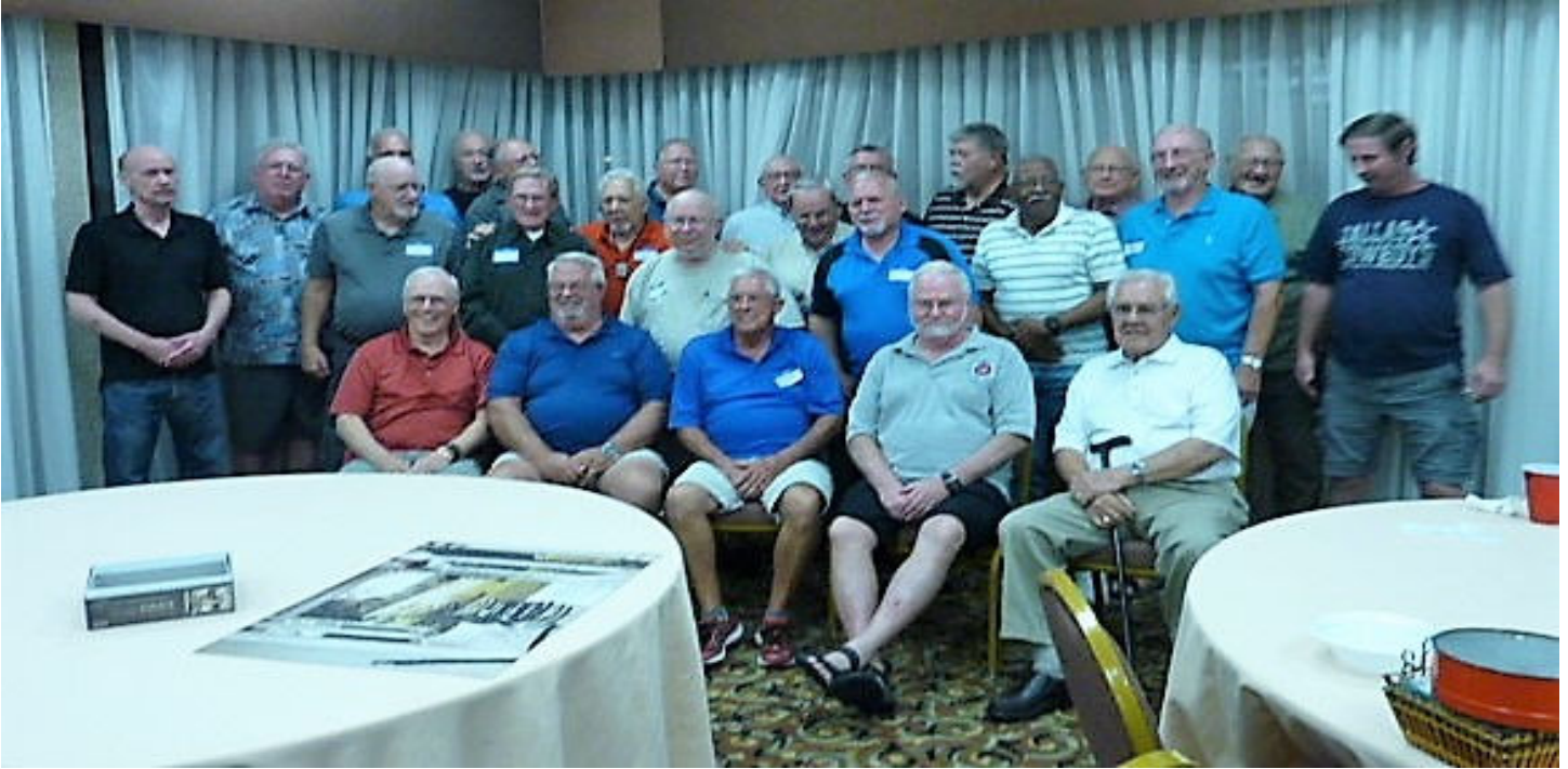
Informal Reunion Hooligans