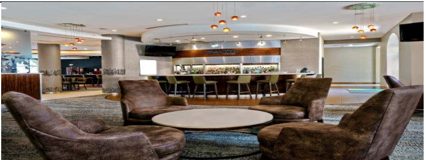
San Antonio, Texas Courtyard by Marriott AMTA 2021 Reunion Venue